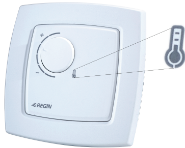
Fig. 1 Temperature indication